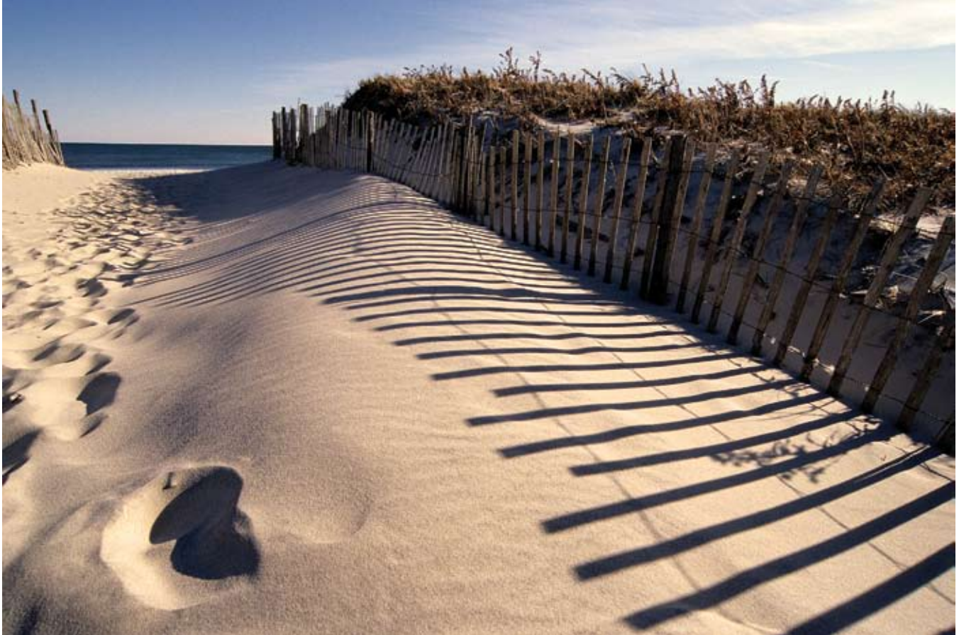
Pathway to the Shore, Long Beach Island, New Jersey

Look To This Day For All It Can Be Because It Will Never Be Here Again