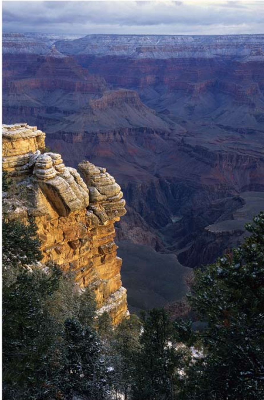
Early Morning, The Grand Canyon, Arizona