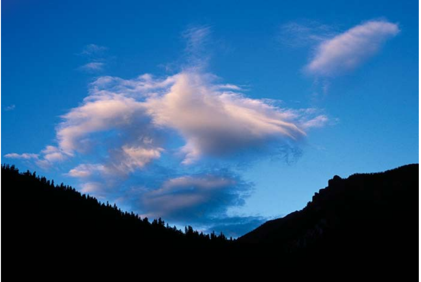
Early Morning Clouds, Ouray, Colorado

All The Words In The World Mean Nothing Unless You Act On Them Or Let Them Act On You