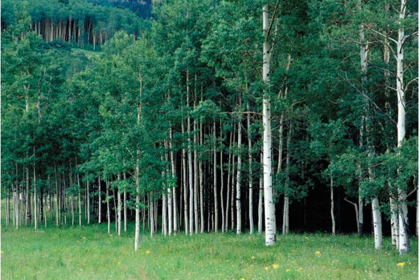
Aspen Grove, Uncompahgre Forest, Colorado

Be All You Can In Ways That Add Balance To Your Life