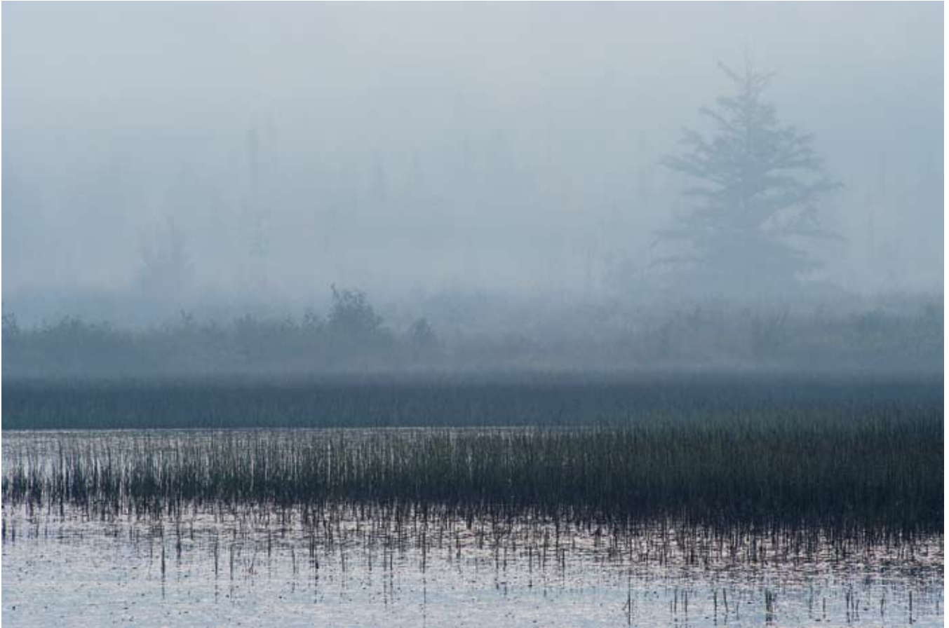
Morning Mist, Lefferts Pond, Vermont

When Life Is Overwhelming Remember To Always Press On For It Is At That Moment You Will Experience The Most Overwhelming Growth