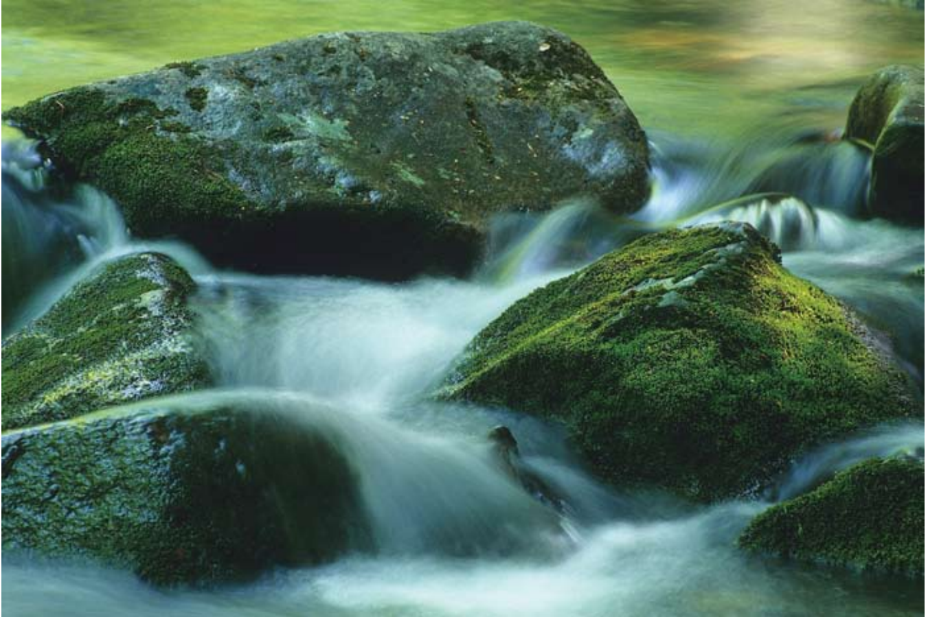
An Early Morning Stream, Harriman State Park, New York