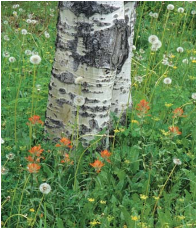
Aspen & Wild Flowers, Uncompahgre Forest, Colorado

Or You May Find Yourself Living Someone Else's