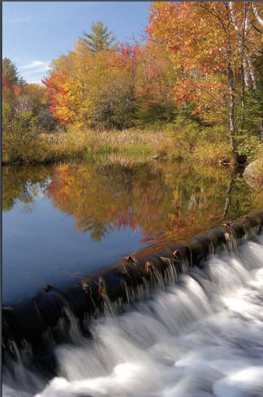
A Gentle Waterfall, Leferts Pond, Vermont

Learn All You Can From Mistakes And Move On Give Them No Further Power Over You