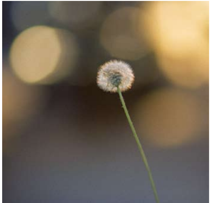
Dandelion, Brooklyn, New York