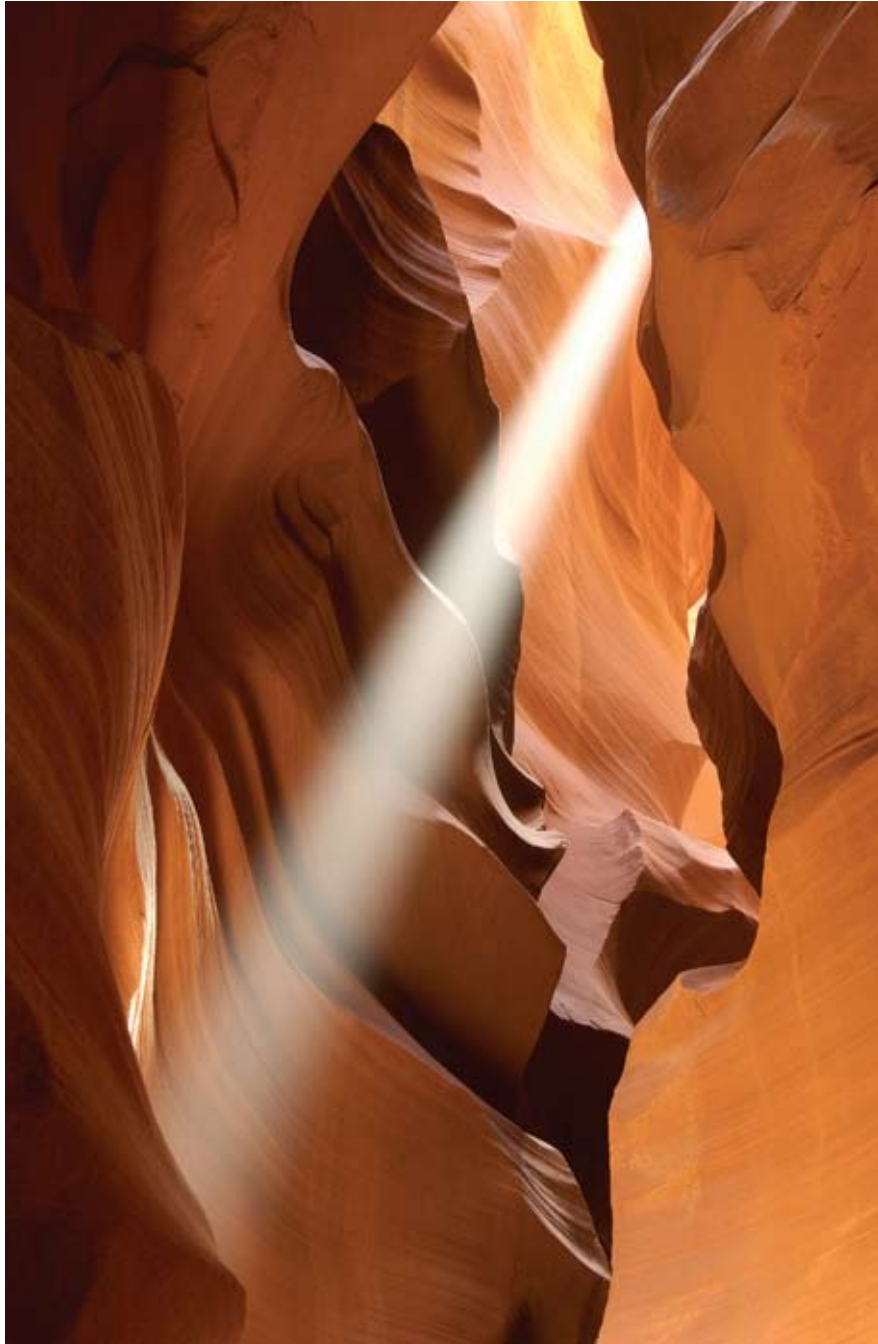
Upper Antelope Slot Canyon, Paige, Arizona

Trust Yourself To Know The Right Answers Because You Know Yourself Better Than Anyone Else