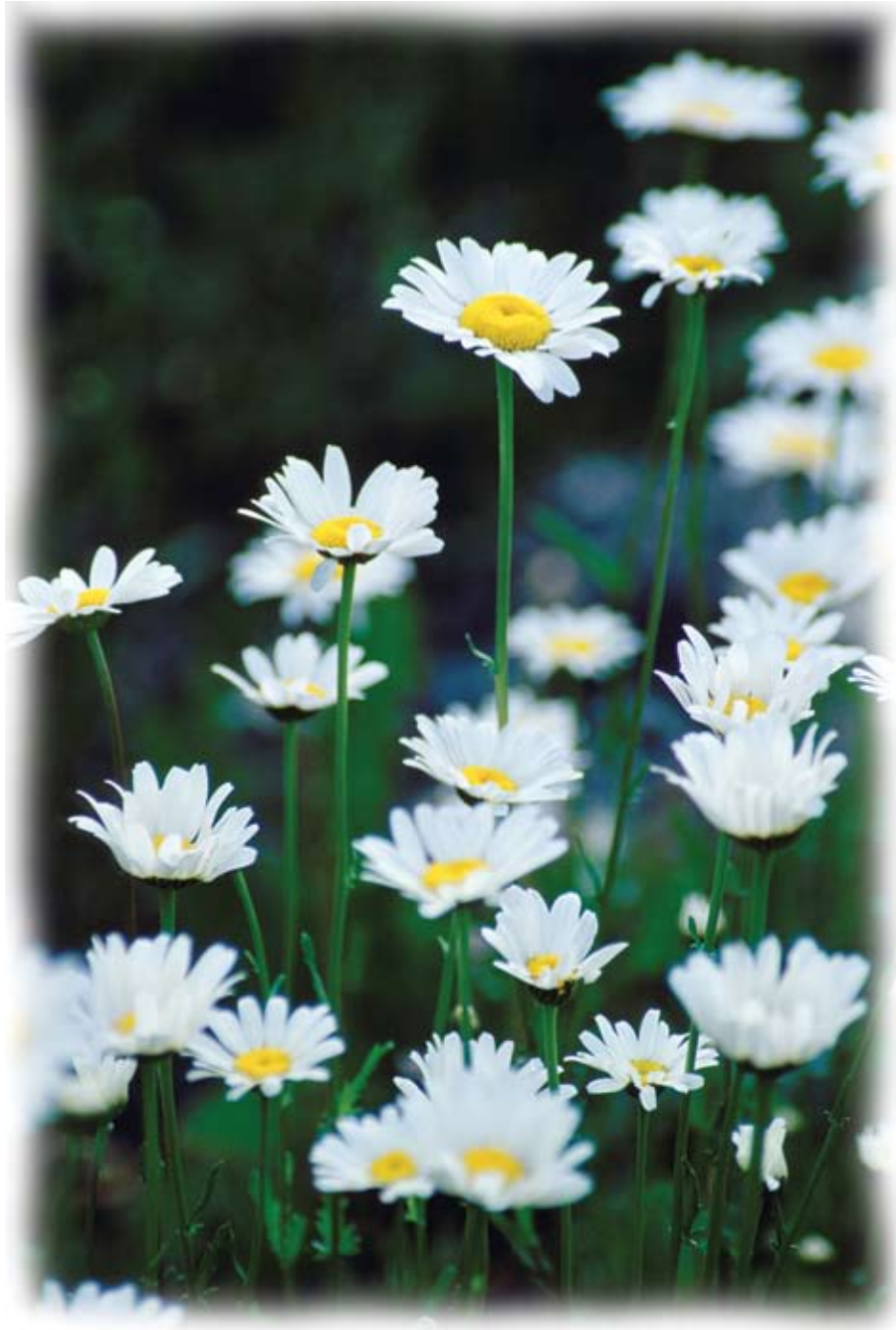
Daisies, Banff, Alberta, Canada

Making A Decision And Being Wrong Some Of The Time Is Better Than Not Making Any Decision At All