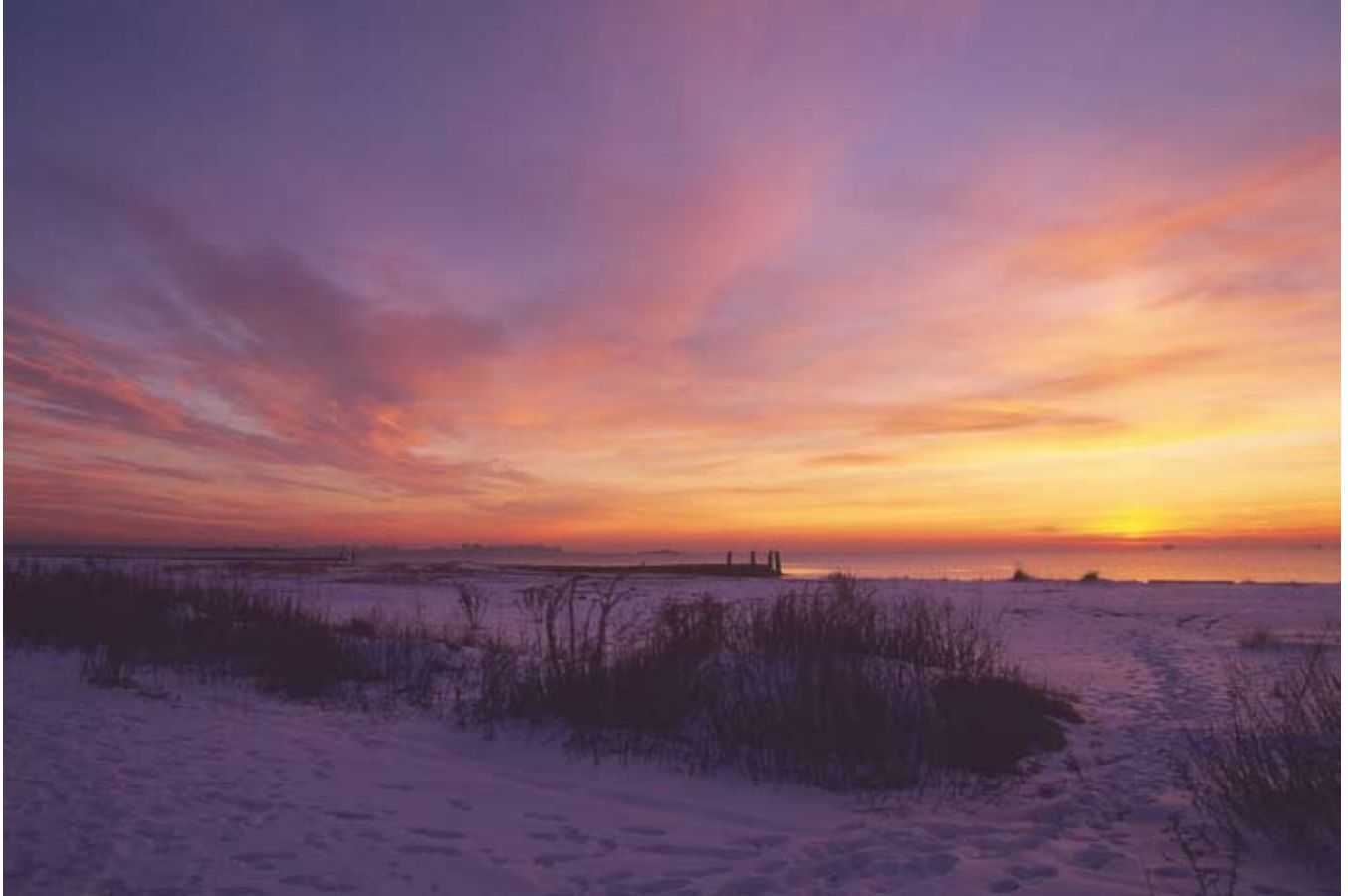
Snow Covered Midland Beach, Staten Island, New York

This Day Can Be The Beginning Of The Rest Of Your Life If You Choose To See It That Way